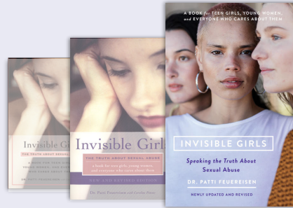
1st Edition, 2005 2nd Edition, 2009 3rd Edition, 2018